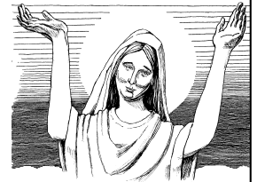
My soul proclaims the greatness of the Lord. Lk 1:46

First Reading: “The Lord bless you and keep you.” (Numbers 6:22-27)